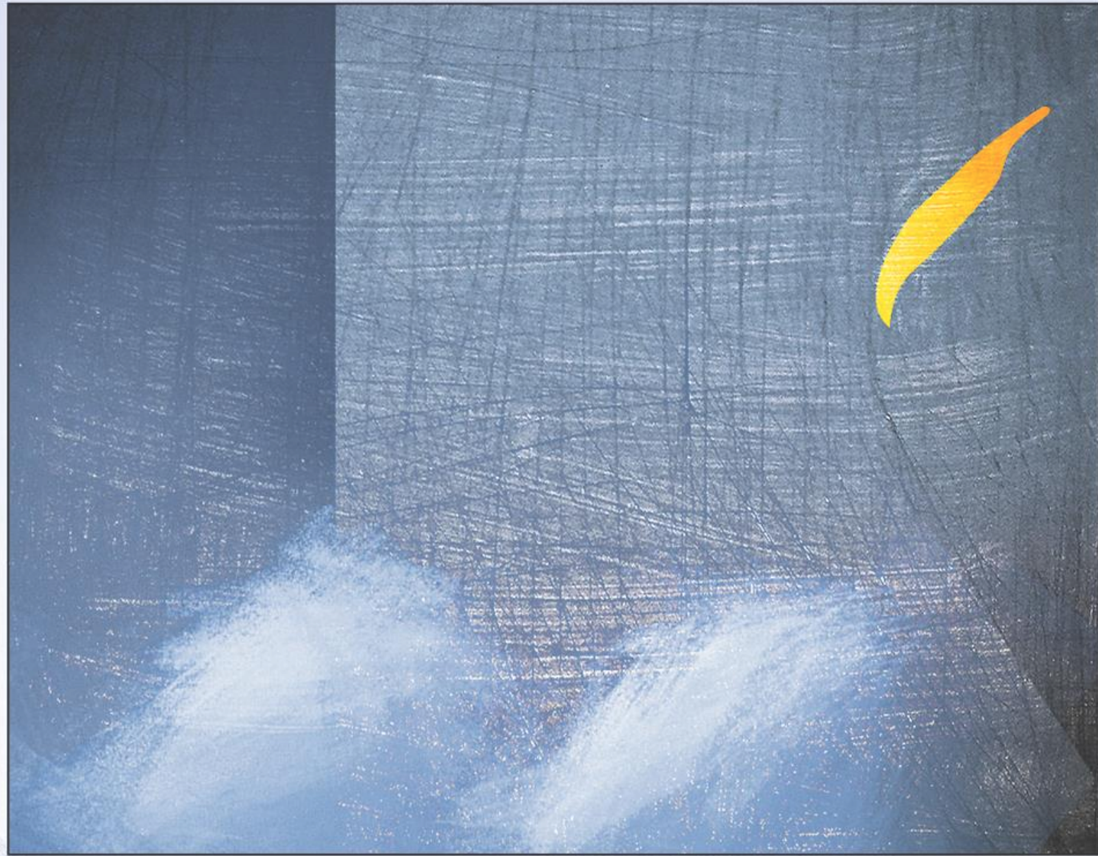
Ways of freedom